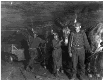
Child coal miners, West Virginia, 1908