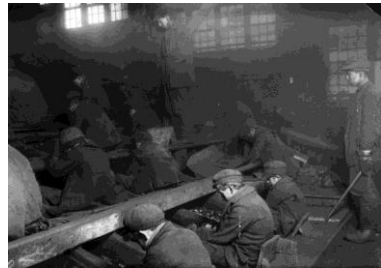
Coal breakers, 1911