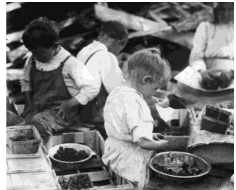
3 y.o. boys hulling berries, 1912