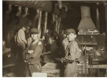
Child laborers in glassworks, 1908