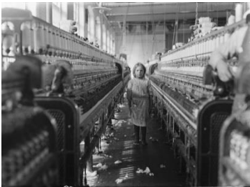
Girl in cotton mill, 1908