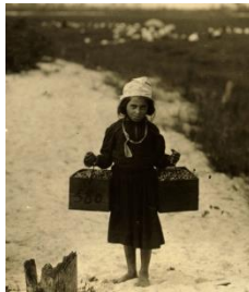
10 y.o. berry carrier, 1910