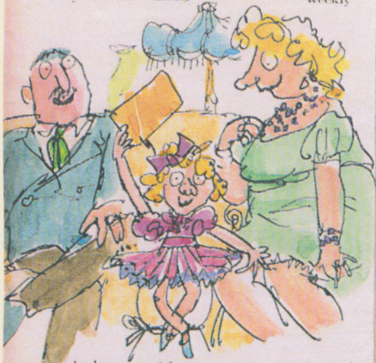
At home with peanut factory heiress and golden-ticket winner Veruca Salt.