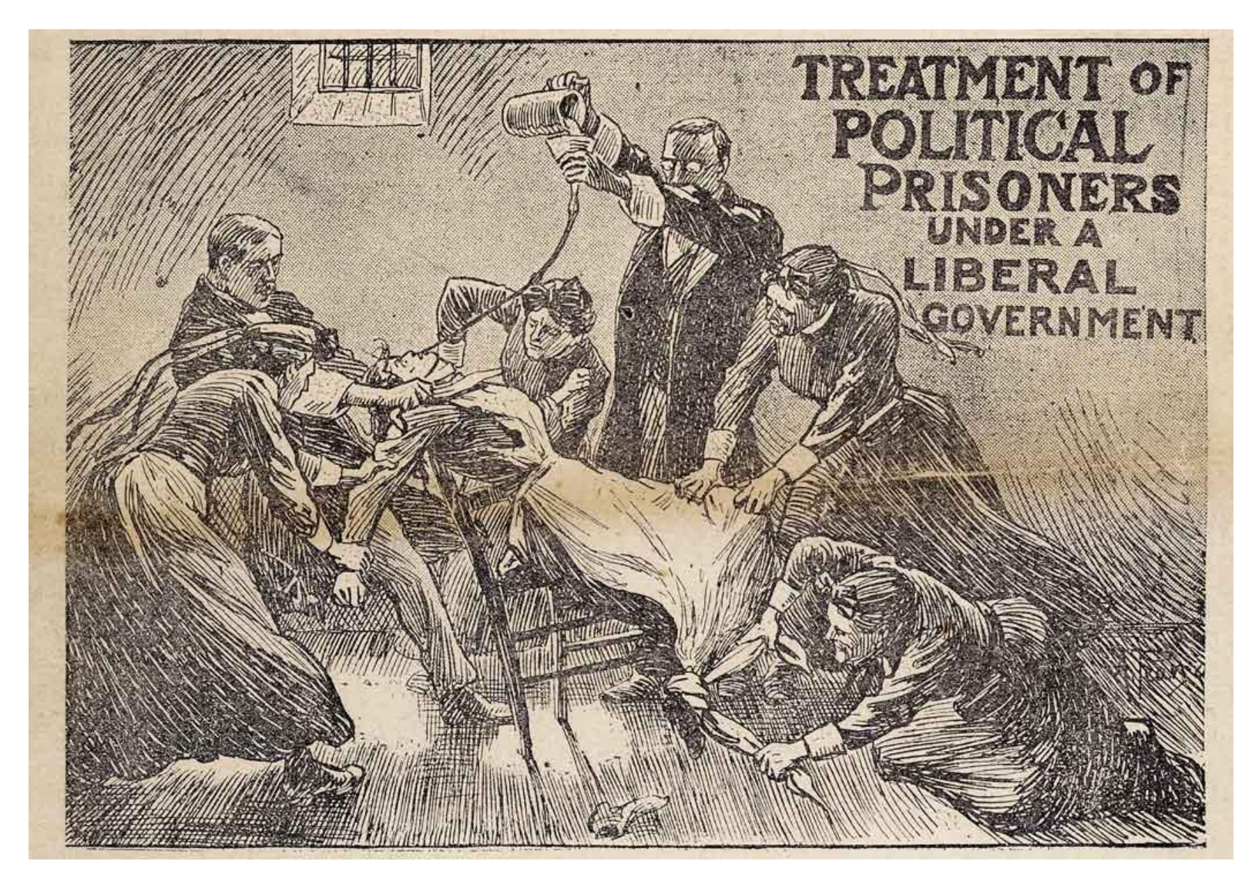
Treatment of Political Prisoners under a liberal government, 1914, from the front cover of The Suffragette newspaper (Friday February 6<sup>th</sup>, 1914)