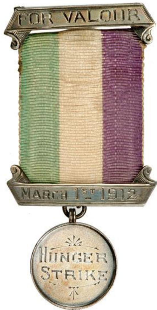
Hunger strike medal presented to Emmeline Pankhurst, 1912