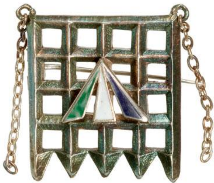
Holloway Brooch, 1909

The brooch was awarded by the Women's Social and Political Union to members who served a period of imprisonment for their militant suffragette activity.